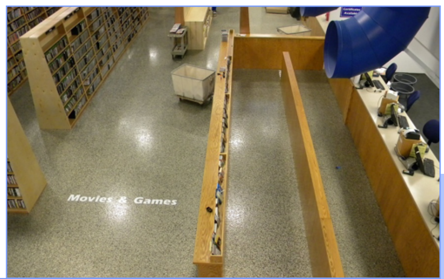
Retail floor area

The toilet walls received a similar treatment, using a finer 3mm FloroChip blend. The artfully installed 100mm high cove base provides additional cleanability and hygene. McKay now has safe, sanitary and stunning floors and walls as a backdrop to their Nashville business. Best of all, by employing low emissions, long-use materials like Florock, they can continue their operation as an environmentallyfriendly member of the community.